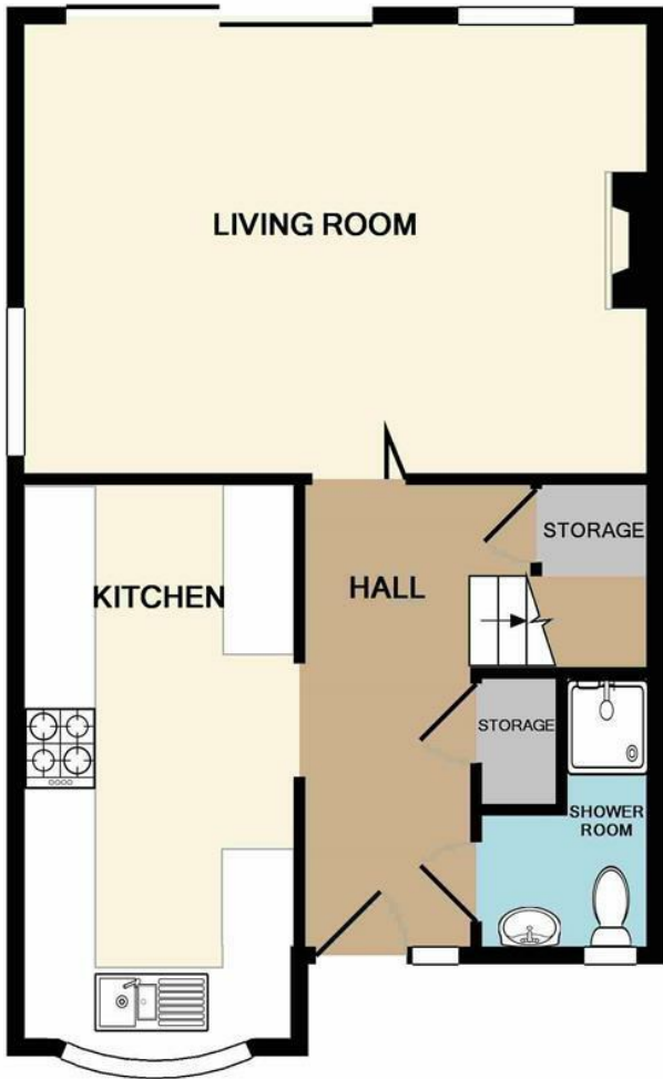
GROUND FLOOR APPROX. FLOOR AREA 488 SQ.FT. (45.4 SQ.M.)